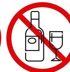
Drugs or alcohol