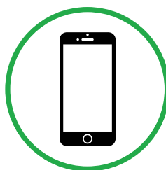
Cell phone and charger