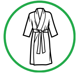
Pajamas and a robe