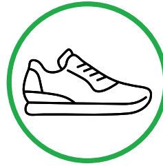
Shoes with a grip