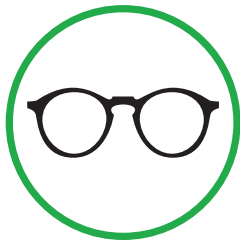
Glasses or contact lenses