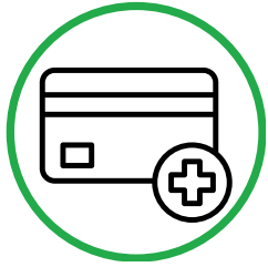
Health card and insurance