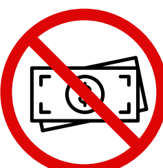
Money or credit cards