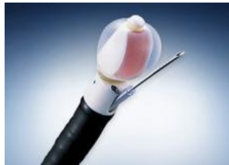
Bronchoscope with ultrasound device

During the EBUS procedure, small samples of your lymph nodes may be removed (biopsies). This procedure is used to diagnose lung cancer, infections, and other diseases that cause lymph nodes in your chest to grow.