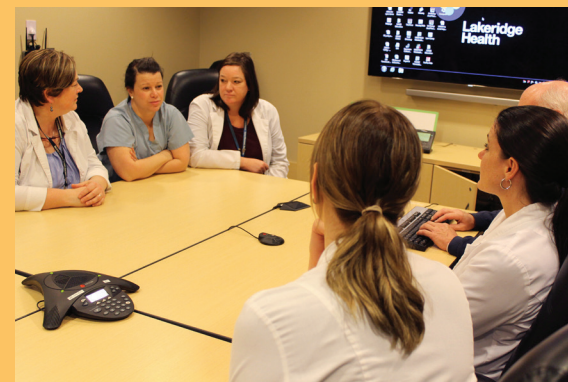
A Multidisciplinary Cancer Conference at the Durham Regional Cancer Centre at Lakeridge Health in Oshawa.