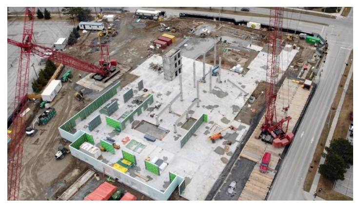
The first-floor walls and the elevator core taking shape just 24 days after the first photo was taken