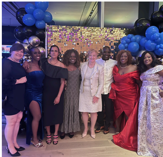
Black Physicians' Association of Ontario Black Joy Gala