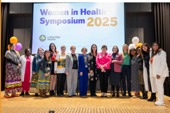
Lakeridge Health's 2025 Women in Health Symposium