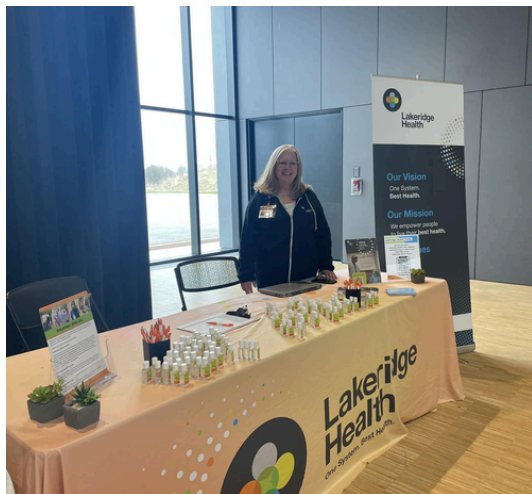
Town of Ajax Volunteer Fair