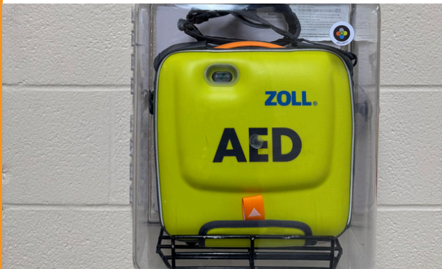
One of the new AED's installed at the Port Perry Hospital