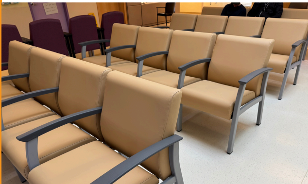
Upgraded seating in the Emergency Department waiting room