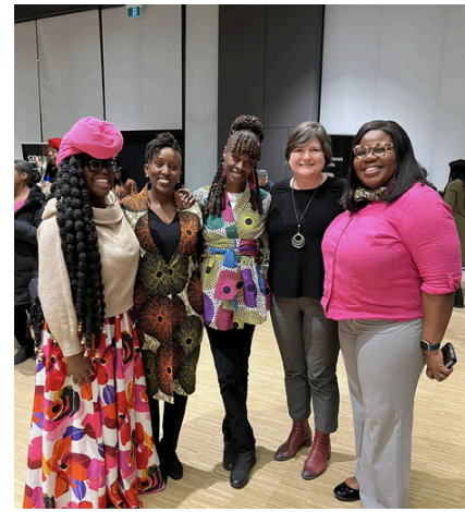
Together We Rise Durham