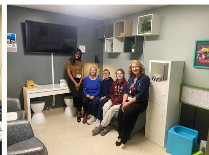
ICU Family Lounge before and after