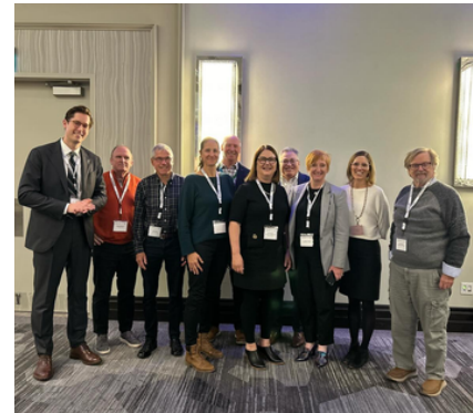
Health for All event