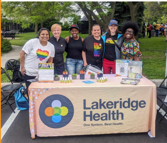
Pride Durham Rainbow Market 2024

Below are just a few snapshots that highlight the energy, connection, and collaborative spirit that drive our ongoing journey toward better care for all.