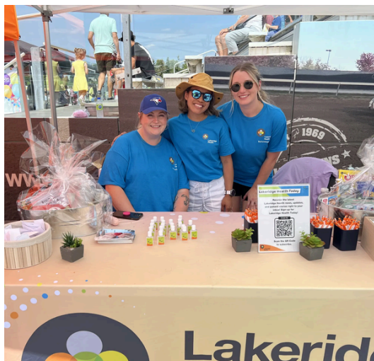
Family Fun Day 2024 at Ajax Downs