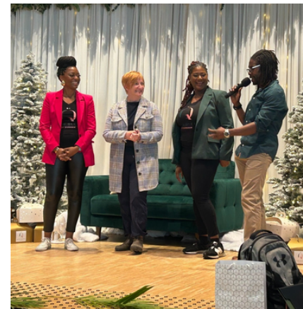
Black Queens of Durham Holiday Pop-Up