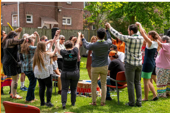
National Indigenous Peoples Day Big Drum Social