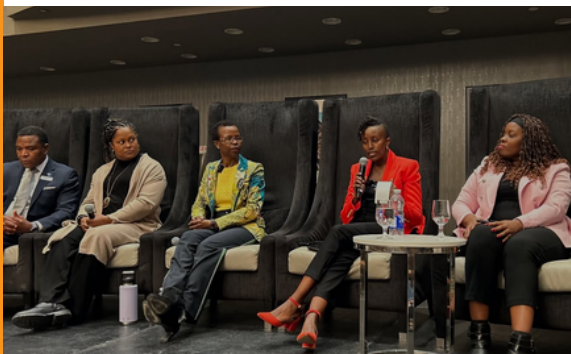
Durham Region's inaugural Black Health & Wellness Day