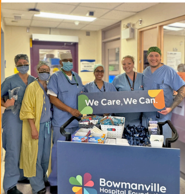
Team members enjoying the Spirit Cart.