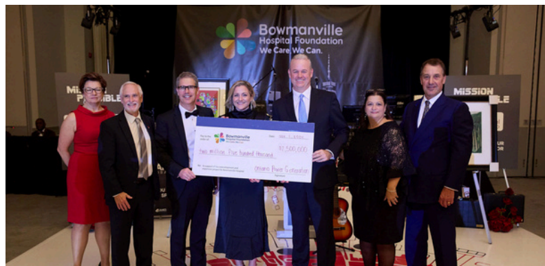
Ontario Power Generation presenting a $2.5 million donation to the We Care, We Can campaign at the Mission Possible Gala