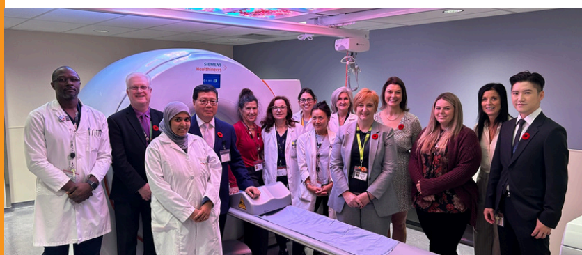
Durham Region's first PET-CT scanner at the Oshawa Hospital.