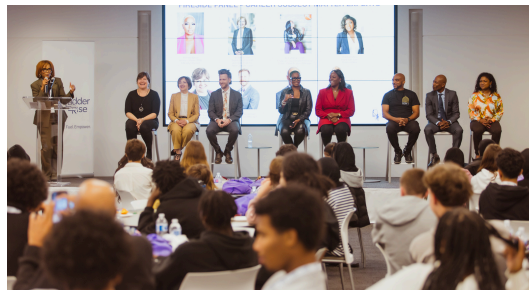
Ladder 2 Rise Youth's annual Take a Kid to Work Day event