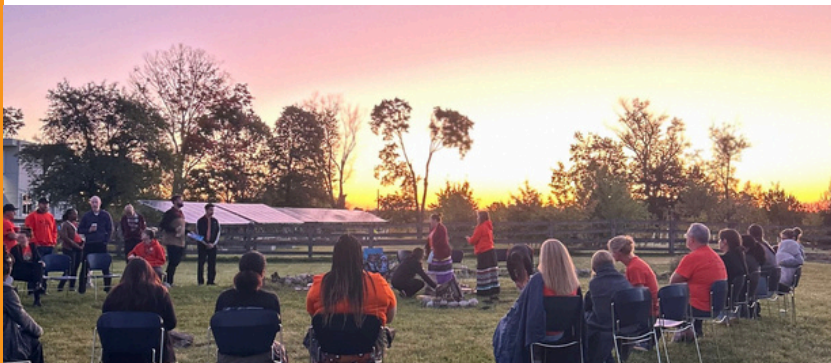
Sunrise ceremony in partnership with Ontario Tech University.