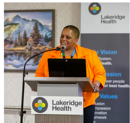
2024 Annual General Meeting