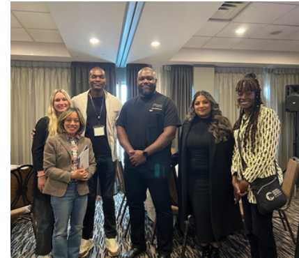
Rest or Reform Conference