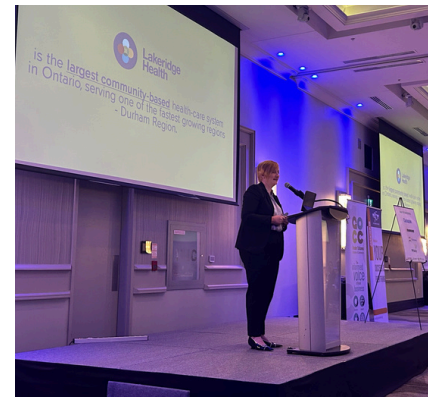
The Future of Health Care in Durham event