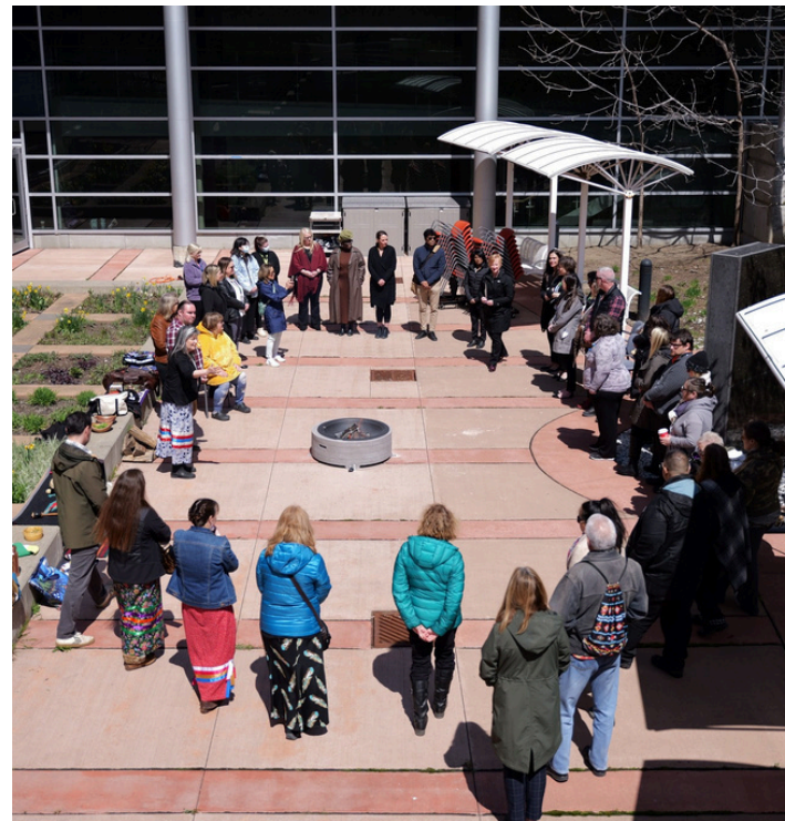
Celebrating Earth Day with the lighting of the first Sacred Fire at the Oshawa Hospital Healing Garden.