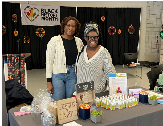
Municipality of Clarington Black Vendor Village