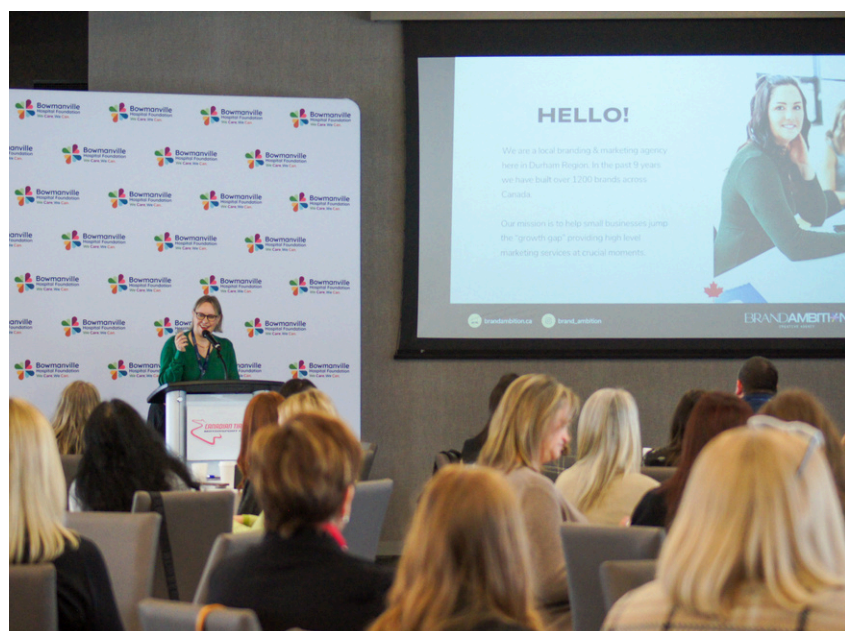
Community members gathered at Pathways to Impact 2025.

To every individual who has joined us in the incredible 2024/2025 fiscal year - thank you. Because of your belief in local care, lives are being changed, and our system is growing stronger.