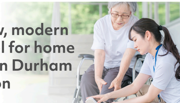
Launch of new innovative home care model, Durham OHT at Home.