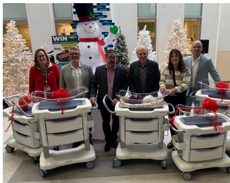
Delivery of new bassinets to the Ajax Pickering Hospital.