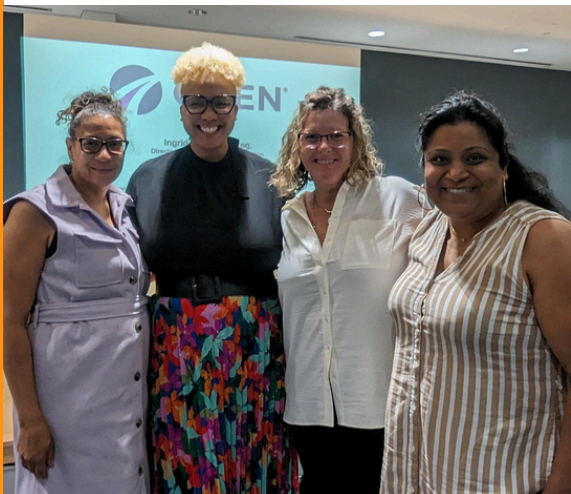
Durham Accessibility Conference