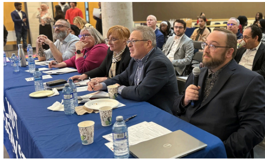
Ontario Tech Brilliant Catalyst Challenge