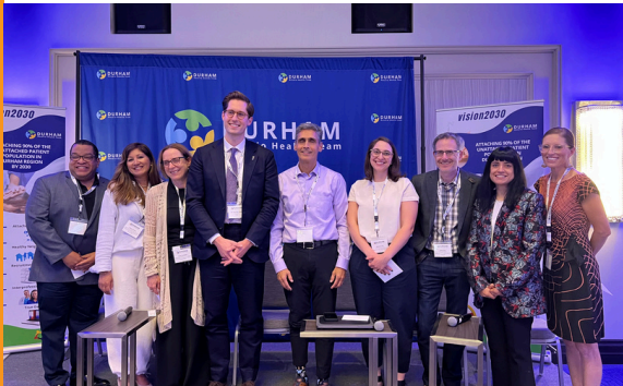
Durham OHT Vision 2030 Event