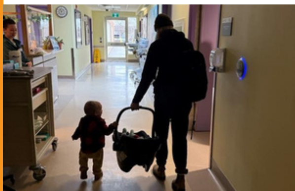
Here for your family, every step of the way

With our community's support, recent additions include new Bili Blankets and an upgraded Phototherapy Light to treat jaundice. These additions allow moms to cuddle and comfort their babies during treatment; a true gift in what can be challenging early days. Soon to arrive are Wireless Fetal Monitor sets, which will allow many new moms to walk, shower, and labour without being encumbered by numerous attached wires.