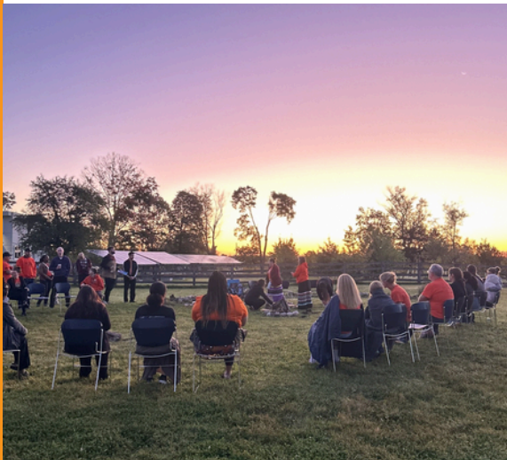
National Day for Truth and Reconciliation Sunrise Ceremony