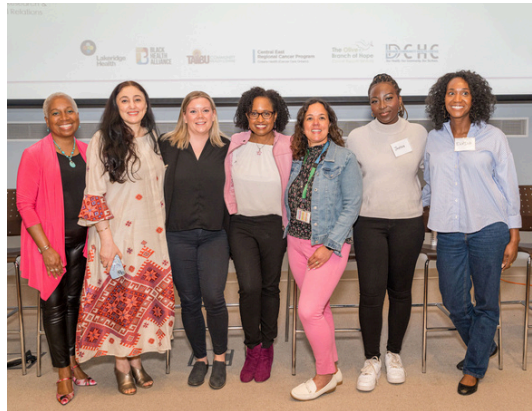
EmpowerHer Breast and Cervical Health Seminar