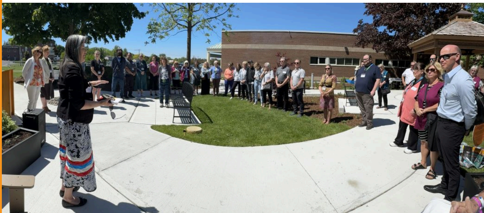
The official grand opening of the Port Perry Hospital Healing Garden.

Together, we are building a stronger, healthier Durham Region.