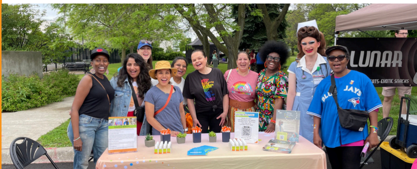
Lakeridge Health team members at the Pride Durham vendor market.