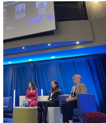
Business Summit: Sustainability & Innovation