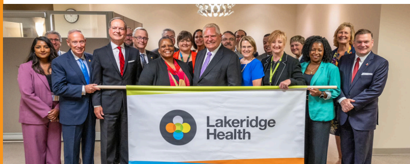
Government of Ontario announces transformative investment towards enhancing health-care services in Durham Region.